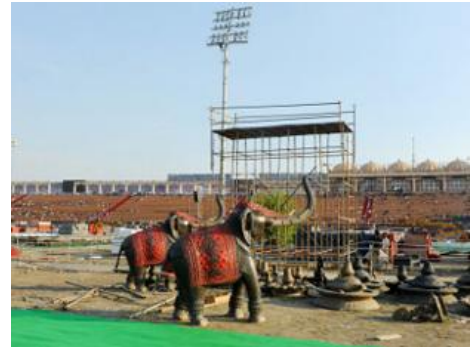
The National Green Tribunal slapped a fine of Rs 5 crore on the foundation while allowing it to go ahead with the event.

In that regard and in exercise of our powers under Sections 15 and 17 of the NGT Act, 2010, we impose an Environmental Compensation, initially of '5 crores," notes the NGT order delivered on Wednesday. A more detailed order is expected subsequently and it is most likely to increase the costs for the AOL Foundation after costs of building a biodiversity park, among other initiatives for restoration of the flood plains, are factored in.